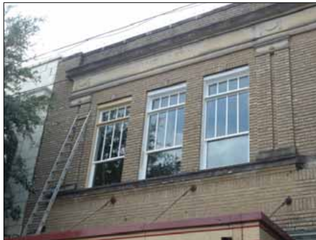
Example of varying sizes of lites in an historic second story window with restoration in progress