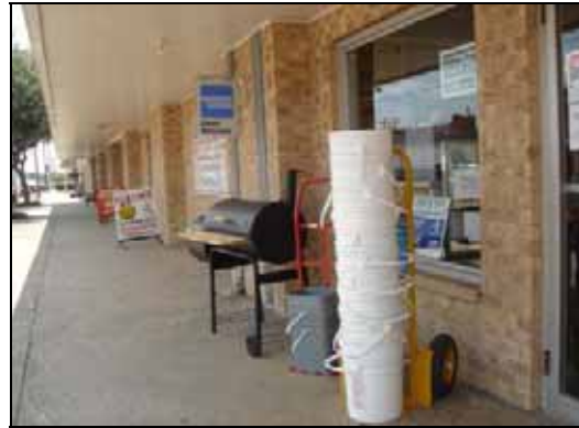
Examples of conforming outdoor retail merchandise display