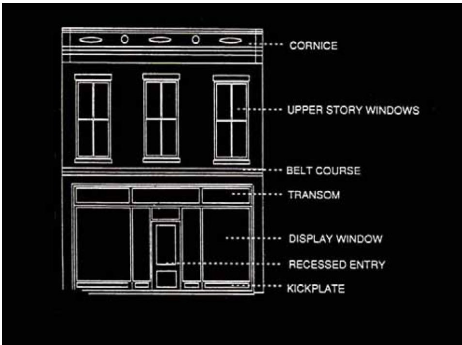
Typical Historic Downtown Commercial Storefront in Texas