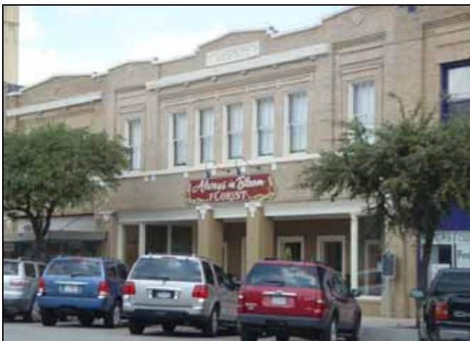
Appropriate Adaptive Use of an historic building on Beaton Street