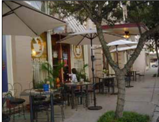
Restaurant successfully interfacing with the Street