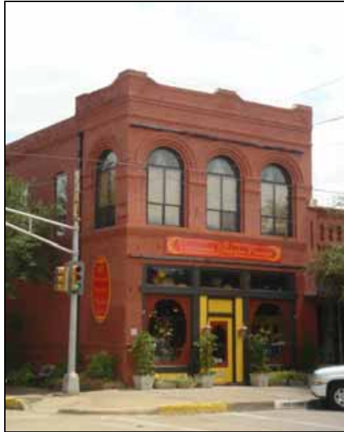
Appropriate use of historic color palette and sign placement

The Historic Downtown District contains a significant number of structures that are important to the original fabric of the community. Special consideration should be given to preserve these buildings. Utilization of historic buildings often requires additions and alterations to adapt the structure to a current use. Alterations, Additions, and Adaptive Use should be done carefully so not to visually impact the significant nature of the original building and shall be subject to review by the Corsicana Landmark Commission before work commences. Historic buildings located in the Historic Downtown District are landmarked by the City of Corsicana, therefore any exterior construction, reconstruction, alteration, restoration, or relocation requires a “Certificate of Appropriateness” approved by the Corsicana Landmark Commission.