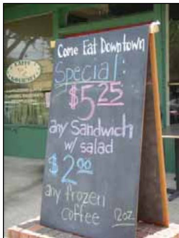
Attractive sandwich sign promotes the "Special of the Day"

Sandwich boards as temporary signage maybe used in the Historic Downtown District during regular store business hours and removed to inside the store at the close of each business day. Sandwich signs may not exceed the dimensions of 30 x 48 and must maintain 4' of pedestrian walkway.