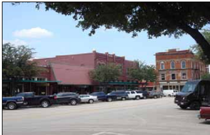
Historic Downtown District Streetscapes in Corsicana